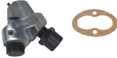
Impact Wrench Throttle Valve Body Kit