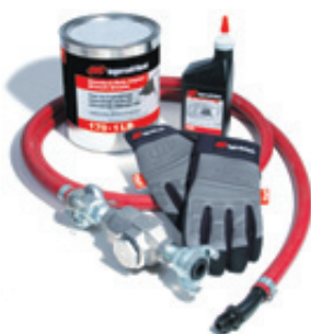
Extended Warranty Impact Wrench Kit