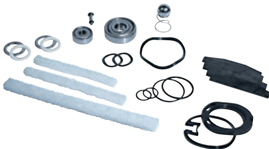
Grinder Tune-up Kit