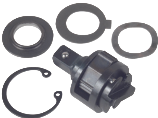
Air Ratchet Head Repair Kit