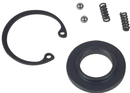
Air Ratchet Spring Repair Kit