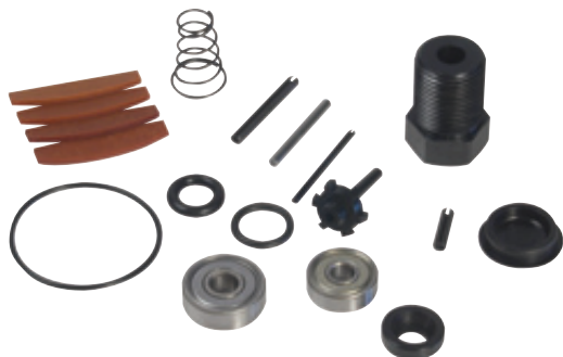
Air Ratchet Motor Tune-up Kit