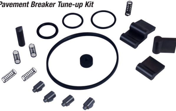
Pavement Breaker Tune-up Kit