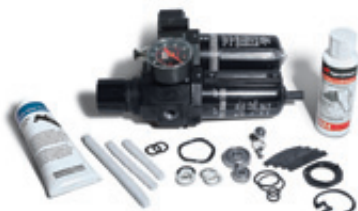
Extended Warranty Grinder Kit

*Purchase a warranty kit with a 3900Ti Series impact wrench and receive a two-year warranty on the impact mechanism.